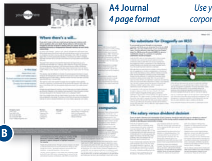
A4 Journal 4 page format