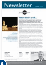
A4 Newsletter 4 page format