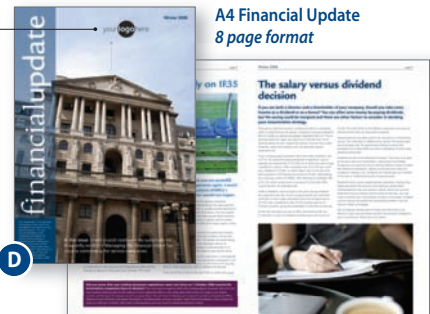
A4 Financial Update 8 page format