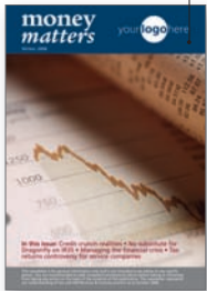
A4 Journal 4 page format